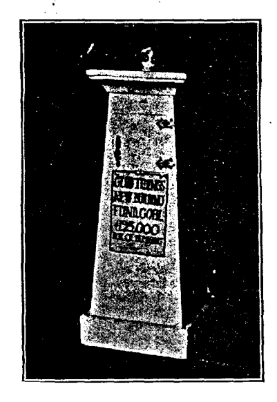
The Box of Blessing

No man on earth can beat God giving. The man who tithes and gives God a regular offering only builds a chute for God to shovel a full supply into his cellar.