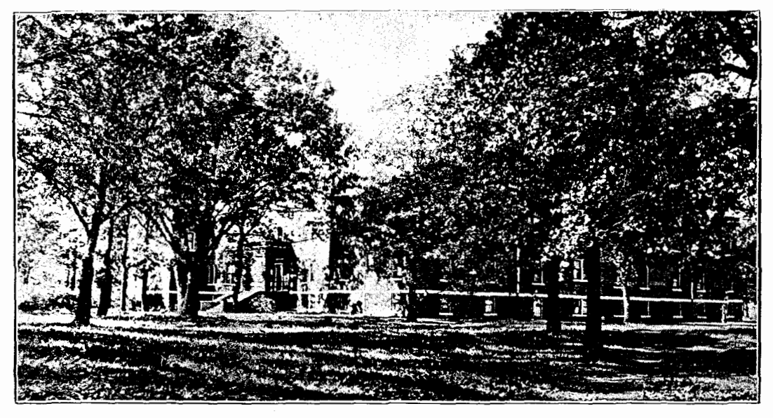
Lights and Shadows on the Campus of the Central Bible Institute